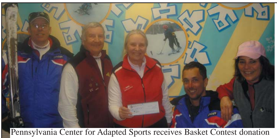
Pennsylvania Center for Adapted Sports receives Basket Contest donation