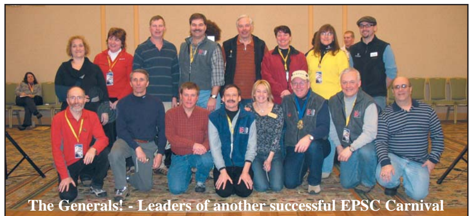
The Generals! - Leaders of another successful EPSC Carnival

Upon return to Breck from Vail, a number of us participated in the Scrub Haul that evening which involved forming teams who then followed difficult clues to go to various restaurants and bars in town and get something innovative from each location to prove they were there. Of course, we all took a little time to make sure we had a drink at each establishment as long as we were there.