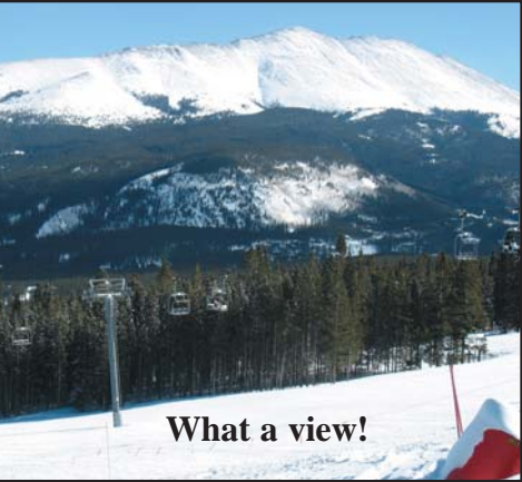
What a view!

the many planned activities. A wide selection of Fleece Vests were available for purchase at the Welcome Party and throughout the week which had really nice embroidery on front and back to commemorate this year's Breckenridge Carnival. A number of these vests are still available in various sizes and colors if you would like to purchase one at a discounted