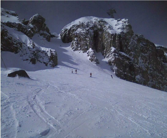
Doesn't look so hard from down here! Recognize this trail ?

Buckridgers enjoyed a fine sunny fall ride along the Schuylkill River Trail on Saturday October 15th, traveling from Valley Forge Park to the canal locks in Phoenixville. A great time was had by all.