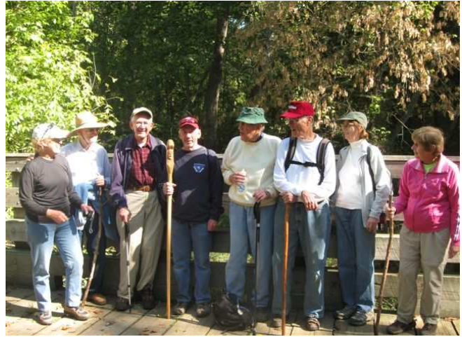
The Brandywine Hiking Group poses. Remember you to look at the camera!

Along with our Western trip to Steamboat Springs Colorado and a European adventure to Cortina Italy, we expect to have a number of skiing activities at the Lodge in Vermont. The annual "Hunt for Snow" will get the season off to a great start. Look for details on this and other group activities in this issue; flyers for Steamboat and Sugarloaf are available in back issues on the web site.