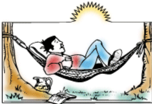
Enjoy your summer!