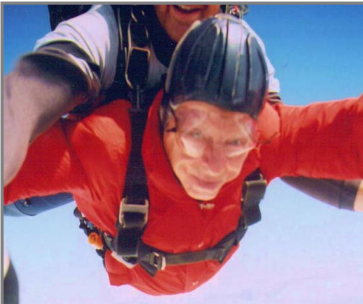
Does anybody know this man??

What's happening at the April meeting? If you think you know the mystery man to the left, be sure to come out to the April meeting to celebrate a milestone for both him and the club!