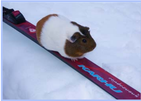
Did the Woodbridge Ski Pig see his shadow?