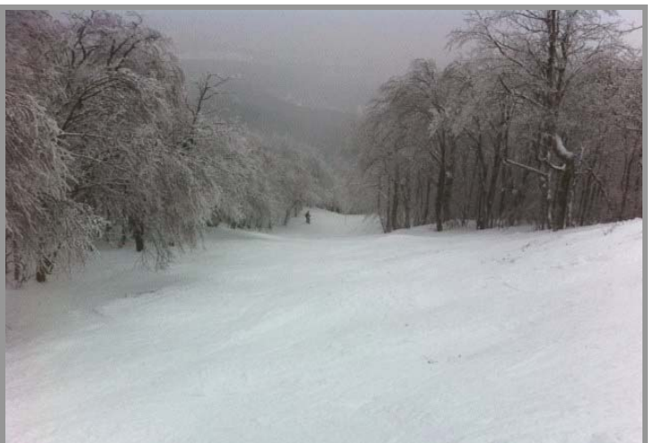
Looking down the Big Bend, first big drop from the start