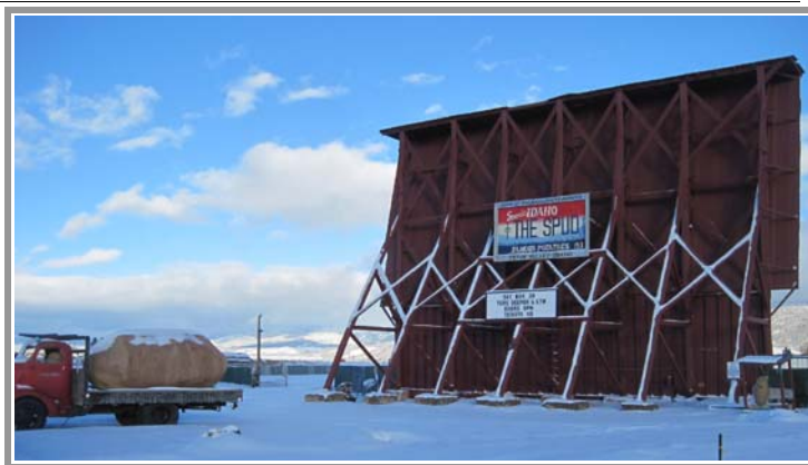
The Spud Drive-In Theatre, with giant spud on the truck.

We really only had one snow day, which turned out to be Thursday when we went to Grand Targhee. GT is a little over 10 miles northwest of Jackson but on the other side of the Tetons, so it took a good hour plus to drive there. The drive took us into Idaho and through some stunning scenery, and best of all past the famous Idaho Spud Drive-In theatre (a