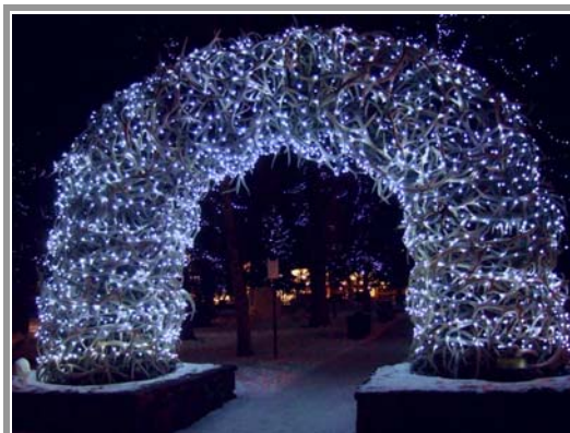
Antler arches at night

elk, started within walking distance of our hotel. Tours were held hourly every day and were quite interesting. The Jackson town square is famous for the archways on each corner made