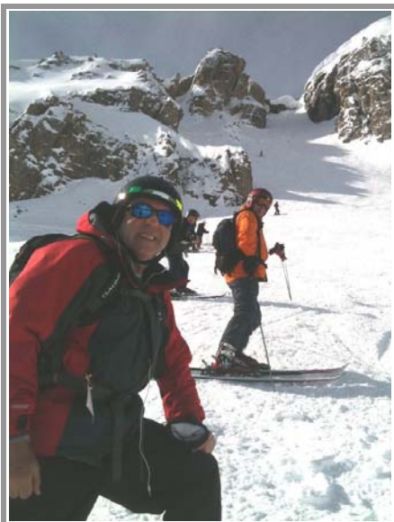
Big 'n steep

Fredericksburg Ski Club from Virginia were both in the same hotel, and we also encountered skiers from the Florida ski club (you could pick them out by their green "gator" flag) and the Morris County NJ ski club throughout the week.