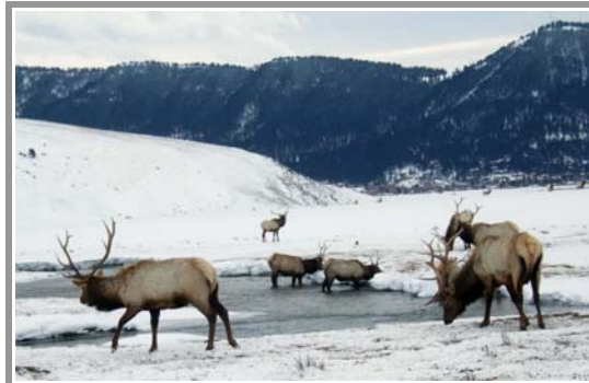
Home on the Range—National Elk Refuge

Folks not up for skiing every day had lots of other activities to choose from. Tours by horse-drawn sleigh of the National Elk Refuge, winter home for several thousand