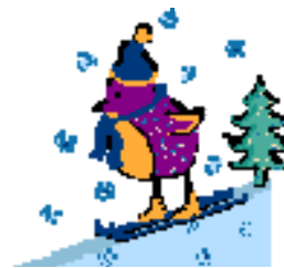
The early bird hits the slopes!