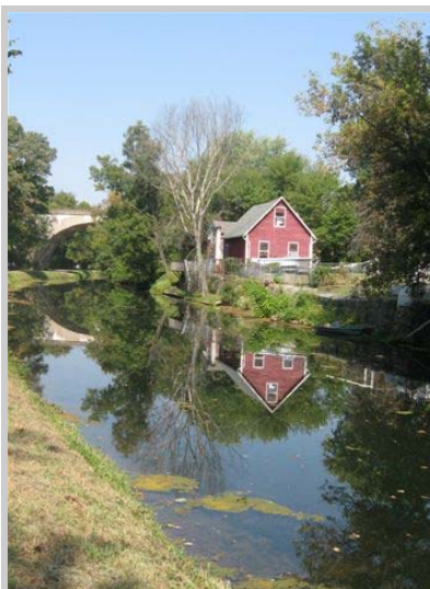
Along the Schuylkill Canal

Our Wednesday short hikes started on September 15. Come out and join us! The meeting place is still at the Granite Run Mall on Baltimore Pike (Route 1) between Routes 352 and 452. Going west from the Media area on Route 1 or Baltimore Pike, turn right at the second stop light after these two roads merge together. (You will see McDonalds on the right and the large Rothman Institute on the left.) At the first crossing make a U-turn to the right into the large parking lot.