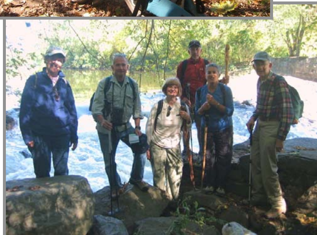
Top: Evansburg State Park / Above: Brandywine Valley Park