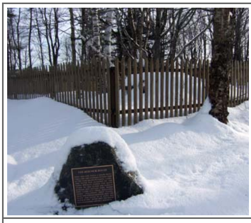
Remains of one of the original homesteads in Old Stratton