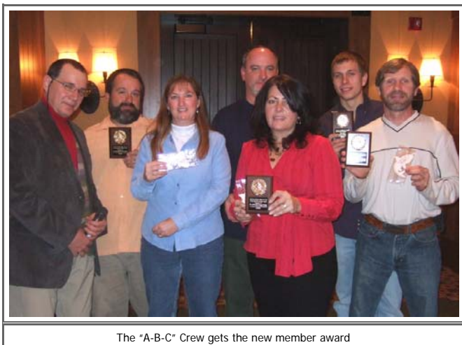
The "A-B-C" Crew gets the new member award

This group (collectively referred to as the "A-B-C's") was responsible for installation of the new roof at the Woodbridge Lodge during the summer of 2008 in what was truly a family effort. Our thanks for a job well done!