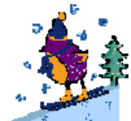
The early bird hits the slopes!