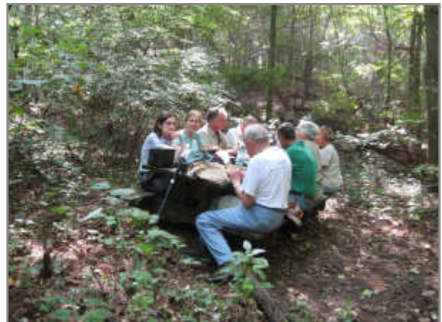
Sept 23 short hike at Myrick Preserve—Looks like more eating than hiking!!