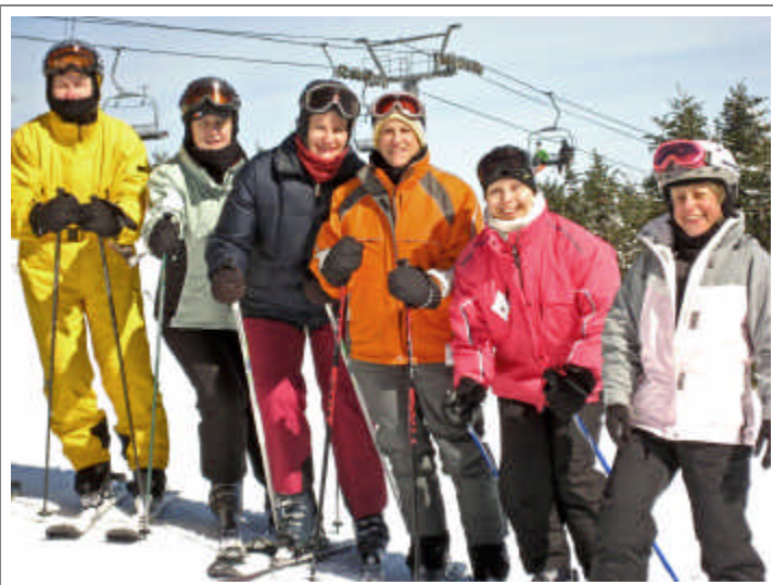
The "Gang of Six" - Terror on the slopes!

First place was Big Sky; second place was Whitefish (Big Mountain); others with more than one vote were Vail and Fernie. Those mentioned once were: Steamboat, Mad River Glen, Snowbird/Alta, Whistler/Blackcomb, Canada, Val D'Isere, Trois Valle', Utah, Lake Louise and Panorama.