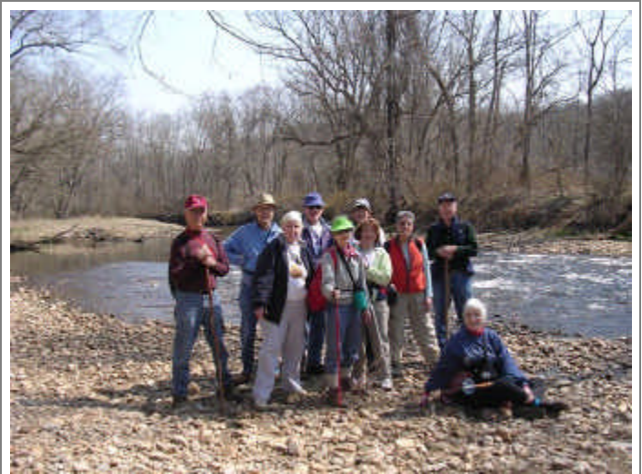
Season's first short hike, White Clay Creek Preserve