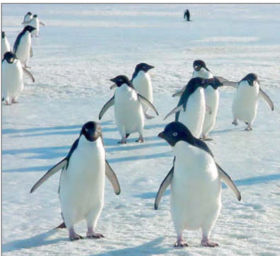
The latest in snow sports fashion