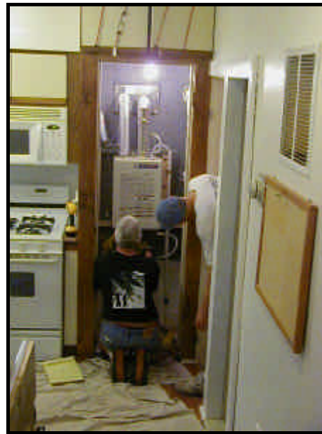
Water heater installation

days. The new unit hangs on the wall in the lower kitchen closet, not much larger than a big briefcase (the old one stuck up from the crawl space into the third bathroom!). With all hot water faucets turned on, the hot water held at a steady 118 degrees. The new unit should produce savings in our hot water heating costs, as it only heats water as it is used. It will also make going into the basement to adjust the water heater when you are first to arrive a thing of the past!