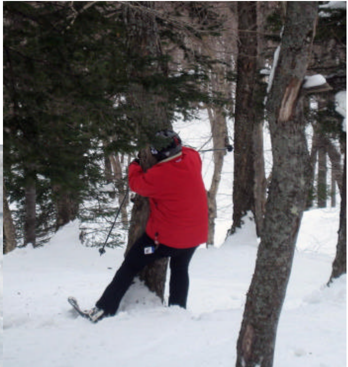
Above: Art gets intimate with a spruce tree Left: See you next year!